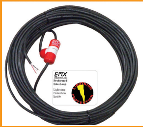
PR-XX (lite preformed loop with lightning protection)