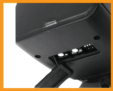
HAWK 2 HAWK 2 ADJUSTMENTS