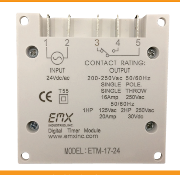
ETM-17 Digital Timer Back Panel