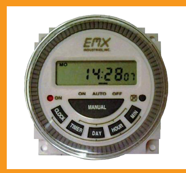
ETM-17 Digital Timer