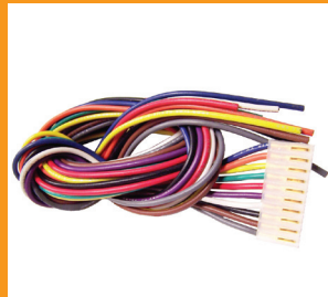
HAR-7 Pin Female Harness