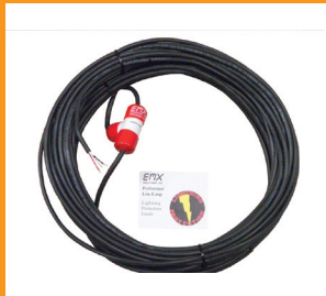
EMX Lite Preformed Loop