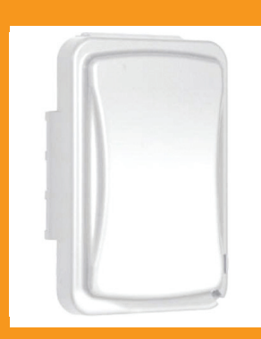
BG-VK2 Virtual Keypad Wall flush mount