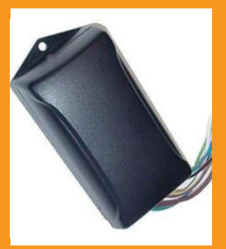
BG-VK3 Virtual Keypad Surface mounting