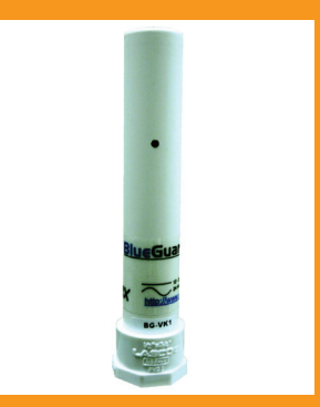
BG-VK1 Virtual Keypad Outdoor model