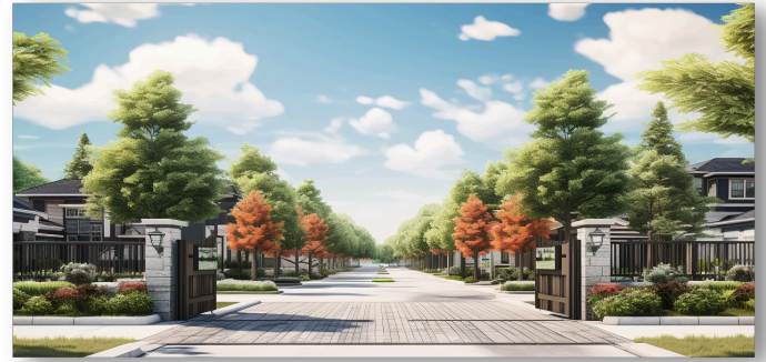
Residential and Commercial Solutions

Our RFID Patriot Series products feature a broad operating frequency, robust/weather-resistant housings, and high compatibility with various communication protocols. Exceptional read ranges cater to various scenarios, while large user storage and real-time processing provide you with the control and adaptability you need. Each product in the Patriot Series is designed with user experience in mind , offering features like LED indicators, relay driver output, and software-adjustable parameters to cater to your unique requirements.